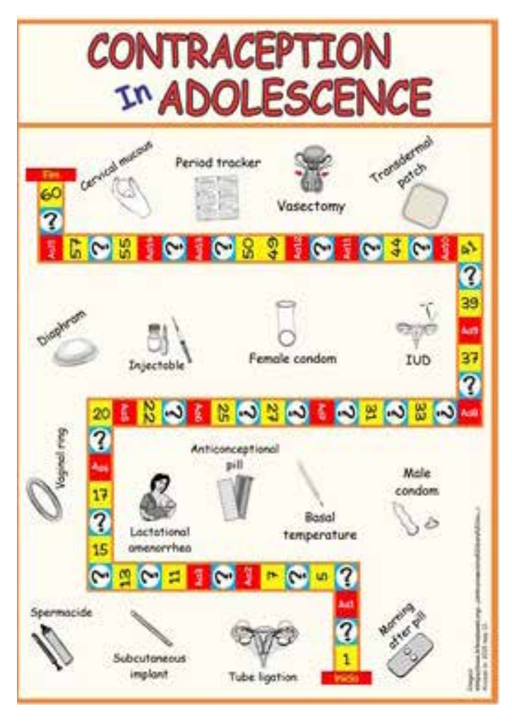
Figure 2. Board game "Contracepción in Adolescence". Aracati-CE, 2018.

The data collection instrument used as pre and post-test was developed and validated