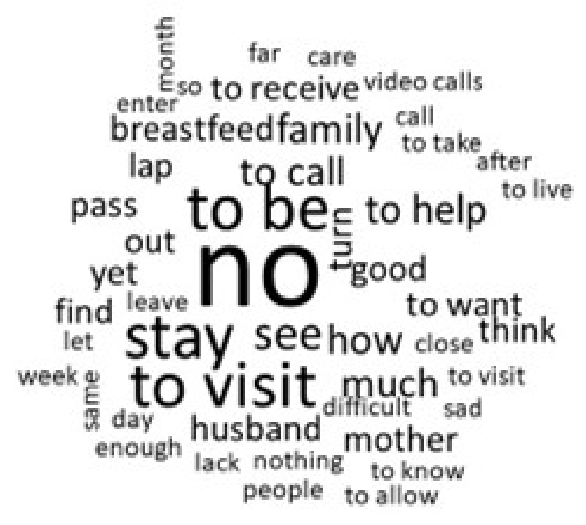
Figure 3 - Word Cloud. Fortaleza, Ceará, Brazil, 2021

corpus was analyzed as a whole and creating a relationship between the words, as shown in Figure 4.