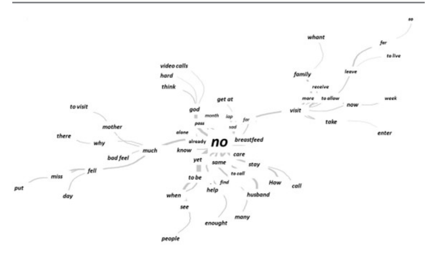
Figure 4 - Similarity of the textual corpus. Fortaleza, Ceará, Brazil, 2021

strict measures were decreed to face COVID-19, such as social isolation.